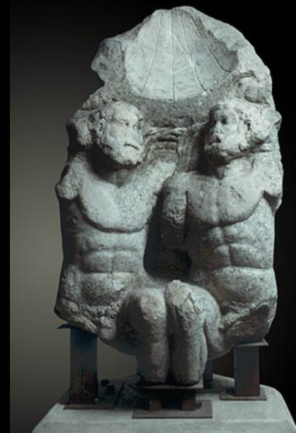
4. https://lupa.at/5719/photos/1 https://lupa.at/5719/photos/10

The sculptural corpus of Sirmium serves as a material record of the city's socio-political evolution within the Roman Empire. From the refined marble portraits of the 2nd century to the rigid, symbolic porphyry of the Tetrarchic era, these artifacts reflect the shifting priorities of Roman artistic expression. The presence of high-quality imports, such as Egyptian porphyry and Carrara marble, underscores Sirmium's status not merely as a provincial center, but as an imperial residence and a pivotal crossroads of the Late Roman world.